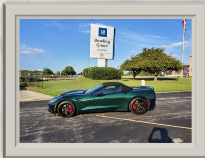
"Back to my birthplace"