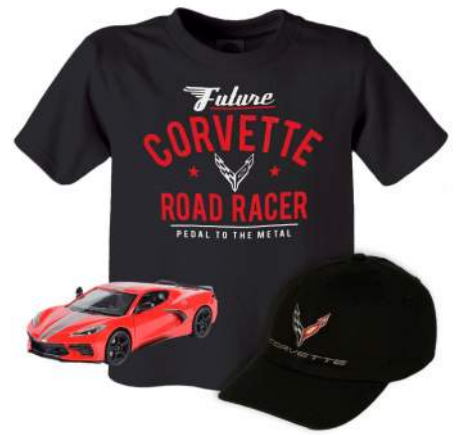
For The kids—$48.00