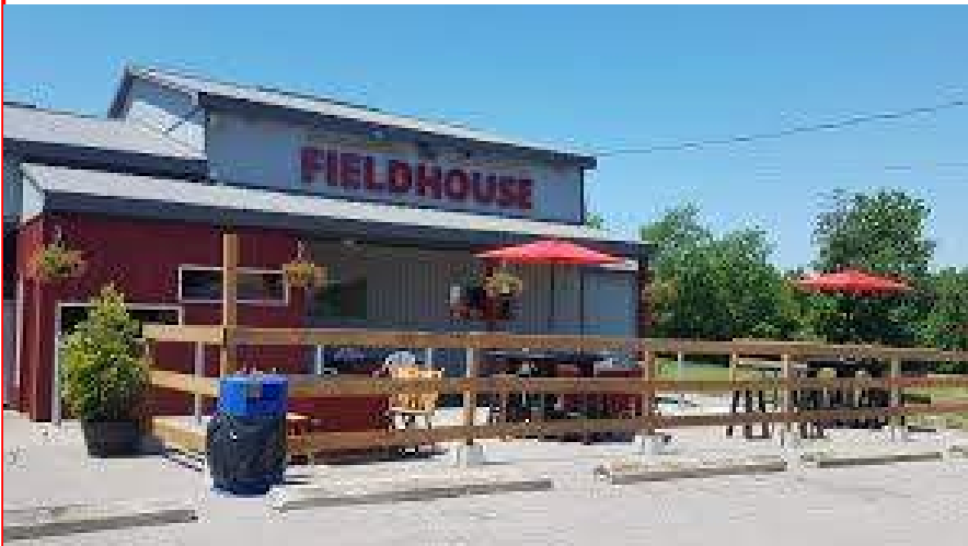
The Field House 911 N Pike Road Cabot, PA 16023